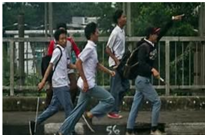
Figure1.2 Student Fight

The drawing form of behavioral deviant done by student such as truant, smoke in class, outclass teaching-learning process time, fight, indiscipline, the student does not comply with school roles, watching porn video, did not using uniform completely, like cheating when examination process, long hair boy, did not use black shoes and kind of violation or indiscipline form etc.