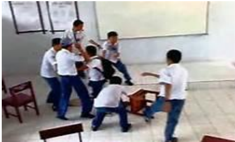
Figure 1.3 Student's bullying and fight make situation class messy

The factors of rising student's behavioral deviant are extern and intern. Factor extern is the factor from around environment, while factor intern is the factor from student itself. The dominant factor on behavioral deviance influence is factor environment or playmate.