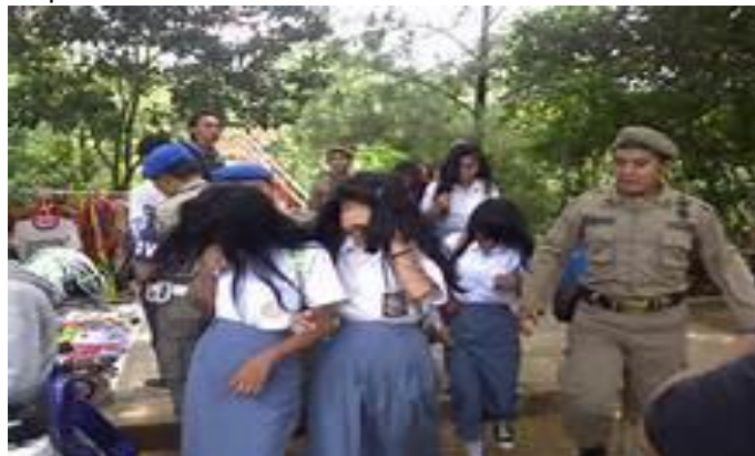
Figure 1.4 student's truancy control by civil service police

Other strategic is used by school teamwork is external and internal strategic. The external strategic includes the cooperation between school, parent and social environment. The internal strategic includes the student supplied with knowledge, willing and skill to understanding all competency especially in value and moral. The habitual action is created skills and good behavior. The strategic of school teamwork following by order and religion team empowered. School teamwork also has strategic on overcoming behavioral deviant with characteristics preventive, curative, corrective, and preservative.